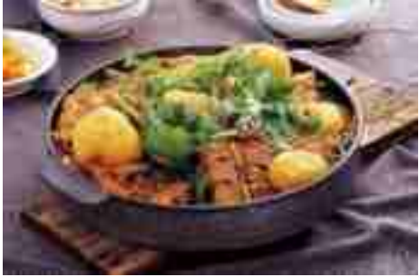
Pork Backbone Stew