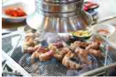
Grilled Pork Belly