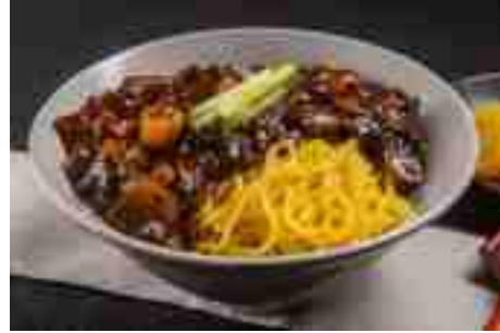
Noodles in Black Bean Sauce