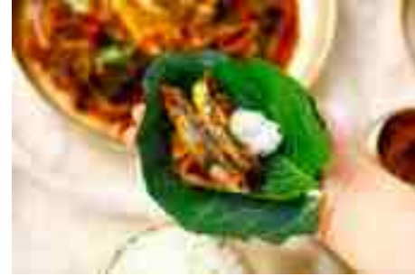
Leaf Wraps and Rice Set Menu